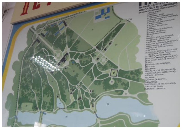
Fig. 3. Reconstruction of the initial state of the ensemble in the local museum