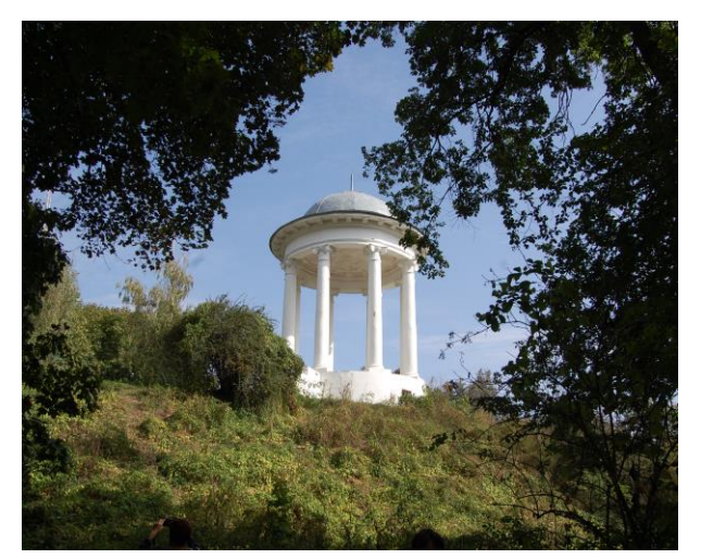
Fig. 2. "Rotunda" on the observation deck