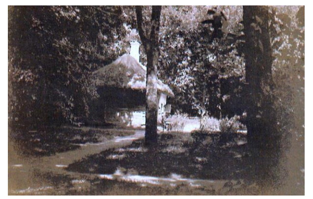
Fig. 8. Hnat Galagan's House

However, in the Sokyryntsi Park at least three features can be identified that significantly distinguish it from other aristocratic parks of the Russian Empire in this period and give it a kind of gloomy color.