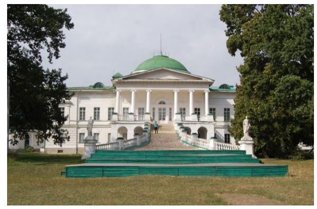
Fig. 6. View of the park facade from the "Big Lawn"