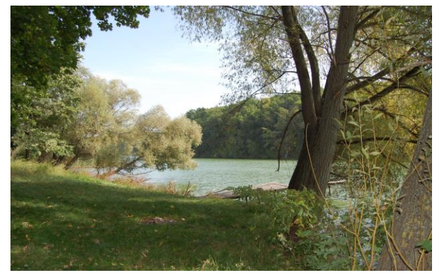
Fig. 7. Landscapes from the shore of the ponds