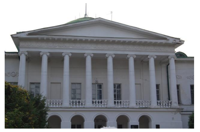
Fig.1. The main facade of the palace

The palace became famous for its unique art gallery, which later became the basis of the collections of the Chernihiv Art Museum. A unique collection of utensils and weapons was collected here. The owners were fans of art, so before the abolition of serfdom in 1861 they had a serf theater and choir, which led to the then name of the Sokyryntsi estate – "Ukrainian Parnassus".