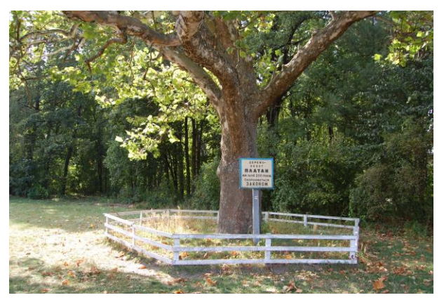
Fig. 5. Old plane tree