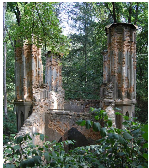
Fig. 4. Remains of the "Gothic Bridge"

The unique nature of the park attracted here the national figures of Ukraine of the 19th century – Panteleimon Kulish, Mykhailo Kostomarov and Taras Shevchenko.