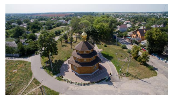
Fig. 6. Church of All Saints of the Ukrainian Land in Myronivka in the structure of the city park