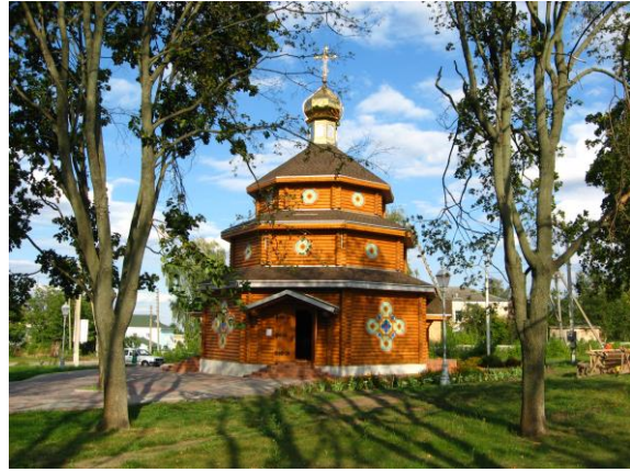
Fig. 4. The Church of St. Demetrius of Thessaloniki in the ethno-complex "Ukrainian village"

Part of the ethno-complex is occupied directly by the ethnographic museum with houses, outbuildings and workshops, there are thematic tours "Architecture and life of rural housing in Ukraine in the late nineteenth century", master classes in folk crafts, minishows on pottery and blacksmithing, and also a mini zoo. Wooden mud-passages, a characteristic element of the Ukrainian estate, add authenticity. There are also greenhouses with tropical plants.