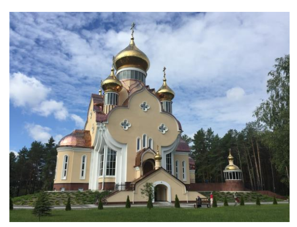
Fig. 8. St. Elijah's Memorial Church Complex in Slavutych