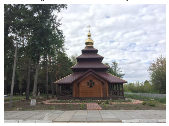
Fig. 7. Natural environment of the church in the village of Oleksandrivka

is why such considerable attention is paid to the peculiarities of location and choice of construction site).