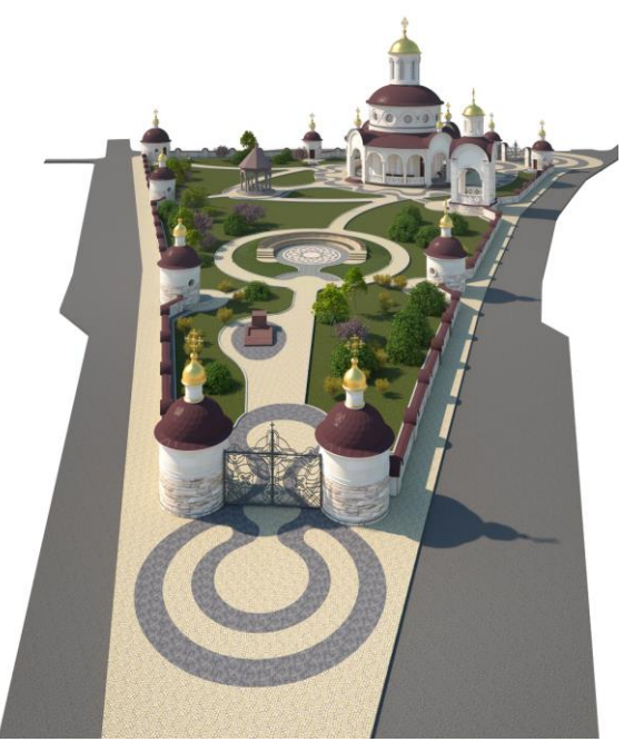
Fig. 5. Landscape design of the Saint Nicolas Temple Complex in Deimanivka village [project of LICENSEARCH]

With certain reminiscences of individual elements of facades in Orthodox churches and temple complexes Scientific and Design Bureau "LICENCEARCH" (author of the project -O.S. Sleptsov) there is no direct copying of historical samples inspired by the architect, but modified national Ukrainian styles are used and attention is paid to design. The specificity of design solutions is that they are a bold experiment with the form of the plan, which, on the one hand, remains in line with Orthodox canons, and on the other is innovative, modern, non-archaic. The following list of modern temples plan types is used: rotunda in various variants (main), as a rule - on a stylobate with a possibility of a circular bypass (columnless, perimeter, with a colonnade on perimeter, with