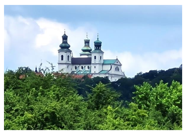
Fig. 3. The Camaldolese monastery complex in Cracow's Bielany

1605–1609. To this day, monks have been living in small houses – hermitages or in single monastic cells.