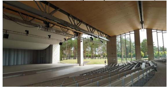
Fig.9. Roja open-air stage / summer concert hall in landscape (View line F ) [photo by the author, 2020]

Psycho-emotional nature of spatial synthesis under the influence of natural and artificial light distribution