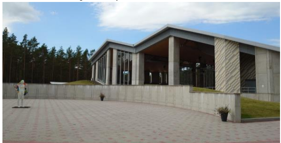
Fig. 3. Roja open-air stage / summer concert hall in landscape (View line C)