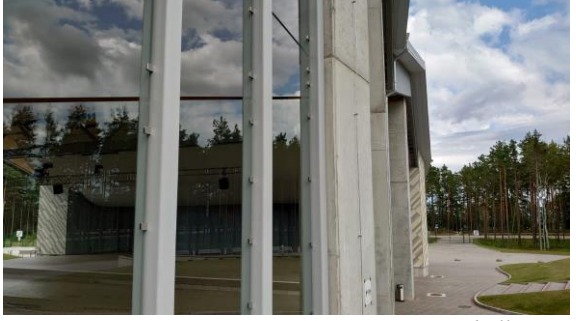
Fig.7. Roja open-air stage / summer concert hall in landscape (View line B )