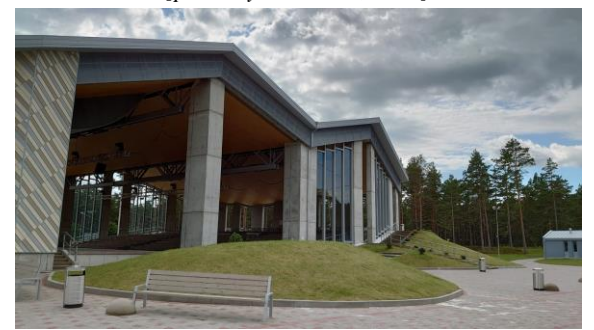
Fig.4. Roja open-air stage / summer concert hall in landscape (View line D ).