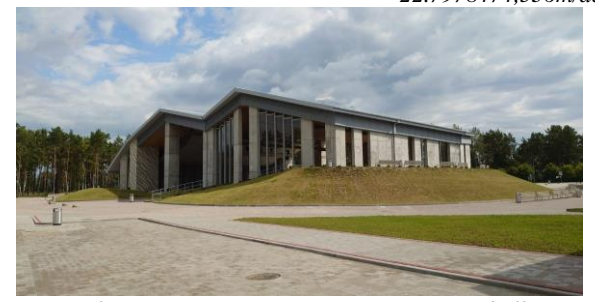
Fig. 2. Roja open-air stage / summer concert hall in landscape, viewed from Jūras Street (View line A)