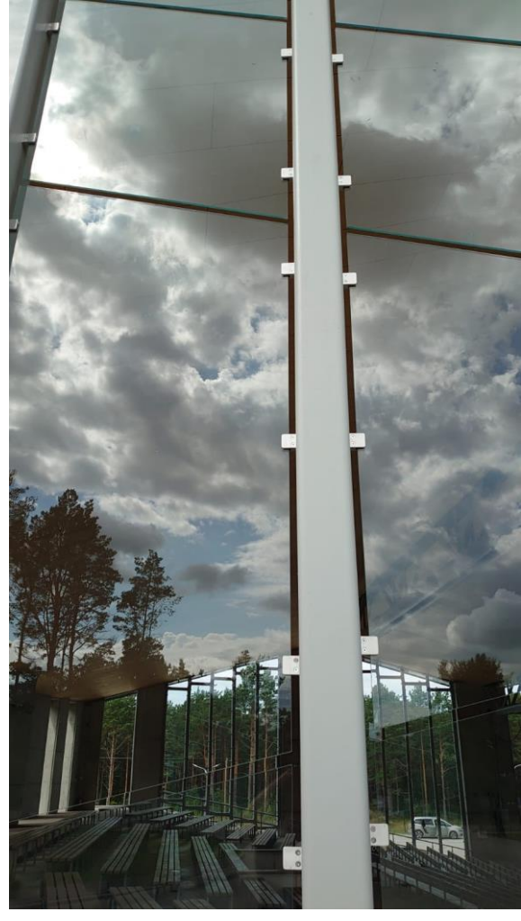
Fig. 11. Roja open-air stage / summer concert hall in landscape (View line B ) [photo by the author, 2020]