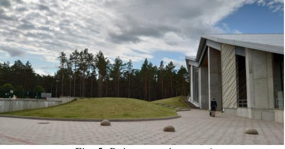
Fig. 5. Roja open-air stage / summer concert hall in landscape (View line C)