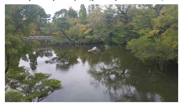
Fig. 4. Eikando Temple Garden. Humpbacked bridges connect the pavilions. Kyoto