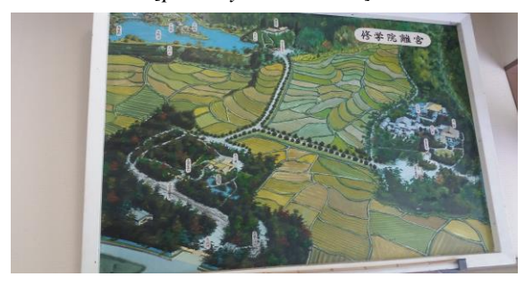
Fig. 7. Plan of the Shugakuin Imperial Villa. Upper villa. Medium villa. Lower villa