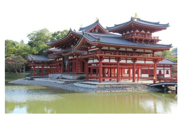
Fig. 1. Byodo-in Buddhist Temple in Uji, near Kyoto. Phoenix Pavilion. Built at the end of the Heian period. The temple garden is built in the Jodo style, or the natural landscape style

methods of water falling in a waterfall are not analyzed in such detail there. For comparison, in the sources you can find references to specific effects in Chinese gardens — sound imitation of wind noise, echoes, birdsong or the noise of a waterfall.