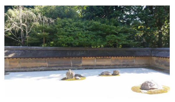
Fig. 2. The Philosophical Garden (Karesansui Dry Garden or Rock Garden) at Ryoanji Monastery. Ukyo District. Kyoto [The 15th of stones are located on a rectangular area of 25 meters, among pure white gravel]

These canons of ideal beauty are different from the canons of beauty in China. In China, there is literally no Sabi in landscape design - rapture with obvious traces of antiquity, mossy stones, all landscape paintings are in the nature of wellgroomed. Wabi – the beauty of the mundane is also alien to the Chinese garden, aimed at enjoying carefully selected beautiful landscapes, even if it is not a man-made landscape. Shibuy in Chinese landscape design, although partly present in admiring natural stones, however, the wooden structures of the pavilions, although made of natural material, are at the same time covered with exquisite carvings and brightly colored, and even holes in the stones were originally skillfully punched by a human hand, and only then began the case was completed by water, giving the holes a natural look. Shibuy principles are present in their purest form in China only in some simple remote mountain arbors with a thatched roof and wooden structures with the color