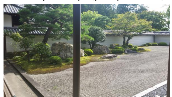
Fig. 5. The eastern rock garden of Nanzen-ji, the garden of the Hojo (abbot's chambers) is 70 % gravel and is characterized by maximum naturalness. Kyoto

Despite the prevalence of the ascetic type of "dry" Zen garden in Japan, there are other types of gardens in Japan, among the greenery, with pagodas and temples.