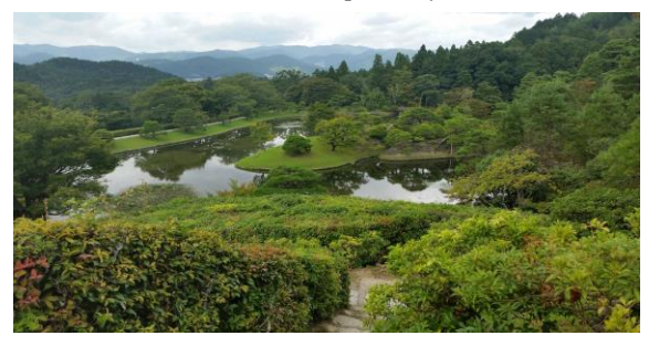
Fig. 8. View of the "Bathing Dragon" pond from the pavilion of the Upper Villa

main temple of the Nanzen-ji monastery. Both gardens were the embodiment of the landscape traditions of the Muromachi period (1333–1568). There are traditions of a garden like karesansui ("dry mountains and waters"), for which the stones were carefully selected according to their shape, color, texture, and correspondence to the style of the complex. It was during the Muromachi era that the first rock gardens appeared – karesansui and sikichyo (stone garden).