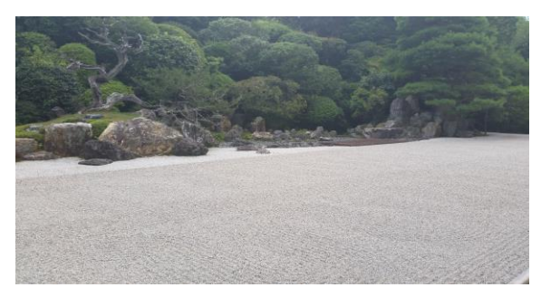
Fig. 6. Rock garden "Crane and Turtle", the proper name "Tsuru-Kameno-niva", Konchi-in monastery as part of the temple complex Nanzen-ji. Kyoto